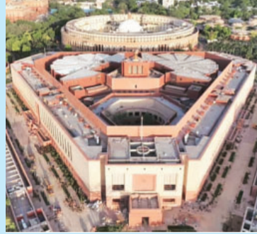
The new session is likely to take place in the new parliament building